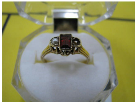
2nd - Rob Blackie 14K Gold Ring w/Ruby