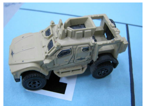
3rd - Rob Blackie Toy SUV