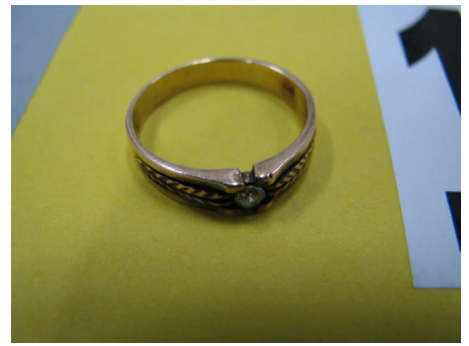
3rd - Syd Birch Gold Ring