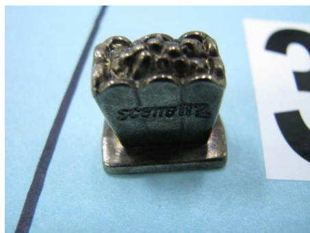
2nd - Syd Birch Game Piece